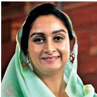
HARSIMRAT KAUR BADAL