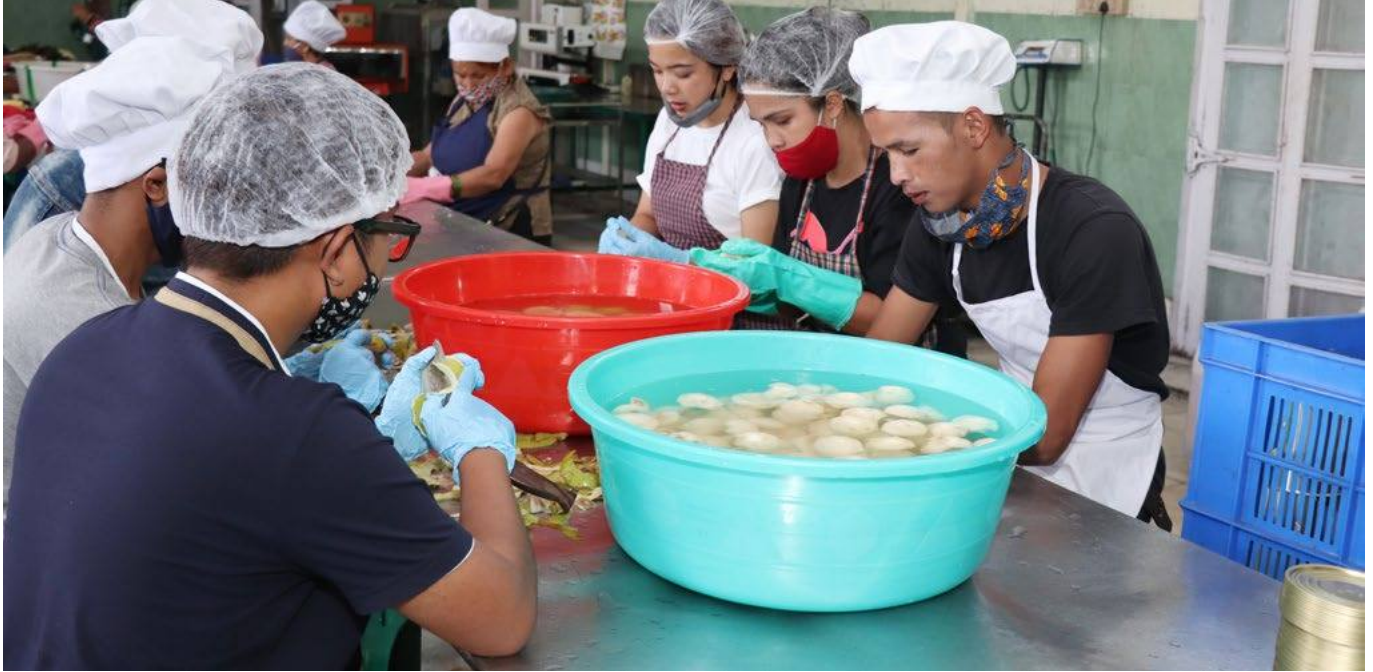
Chonchongipa cha'ani tarigipa dolrangna Prime Minister-ni on'gipa scheme (PM FME)